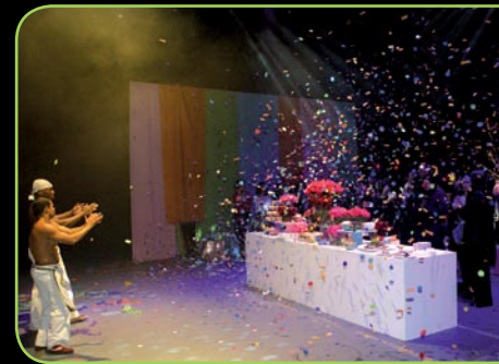
CONFETTI USING "BIG SHOTS"