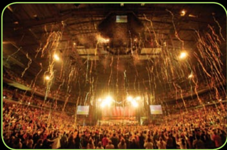
STREAMER EFFECT CREATED USING "BIG SHOTS"

Hand feed confetti through the specially designed inlet to launch confetti. Either through a moving tube creating a spray of confetti or fix the tube via rigging points to elevate the confetti dispersment point. Perfect for large venues requiring large coverage from the ground or catwalks. EFX fans can be used without the tube creating upward wind currents to enhance confetti effects as well.