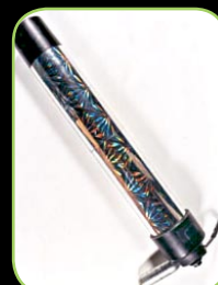
2" + 1" HANDHELD CANNONS