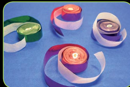
DOUBLE ROLLED STREAMERS