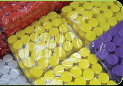
VARIETY OF SHAPES