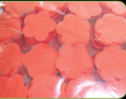
1KG BAG OF CONFETTI