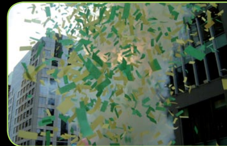
CONFETTI USING "BIG BLASTER"