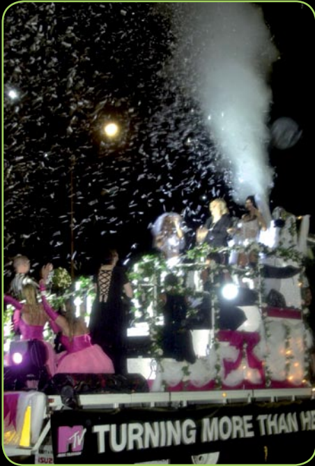
MARDI GRAS 2004 MTV FLOAT