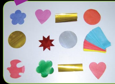
VARIETY OF SHAPES